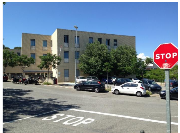
Building P4 from bus stop (lines 8 and 11). View of the rear entry to the building

Bus lines 8 and 11 connect the campus and city centre (~10 mins journey)